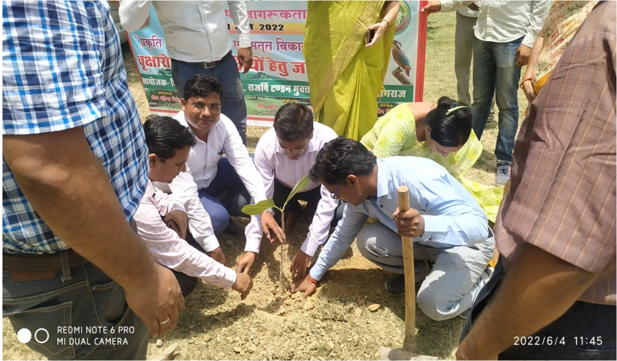
Plantation by faculty of Sciences, UPRTOU