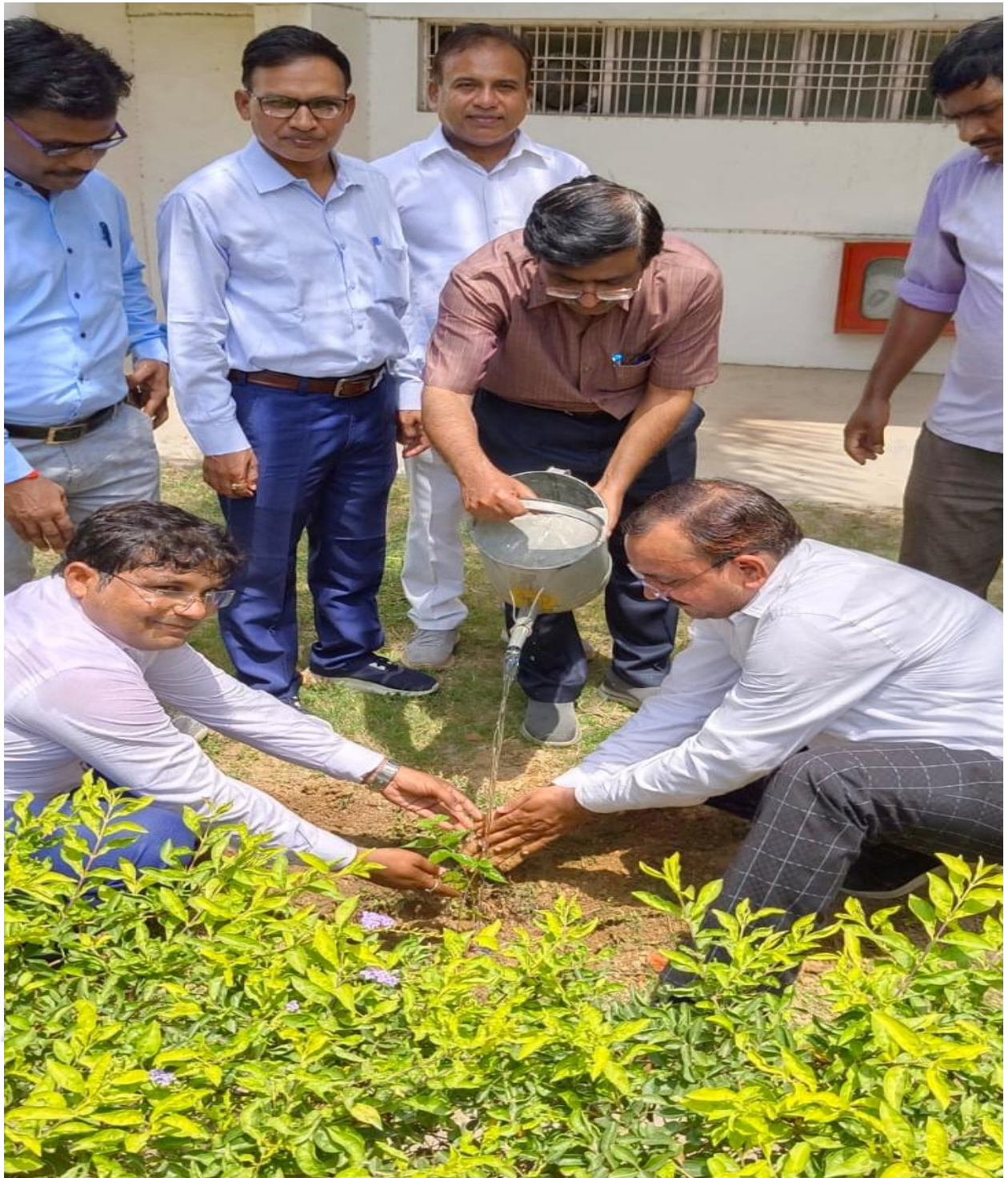
Plantation by faculty of Sciences, UPRTOU