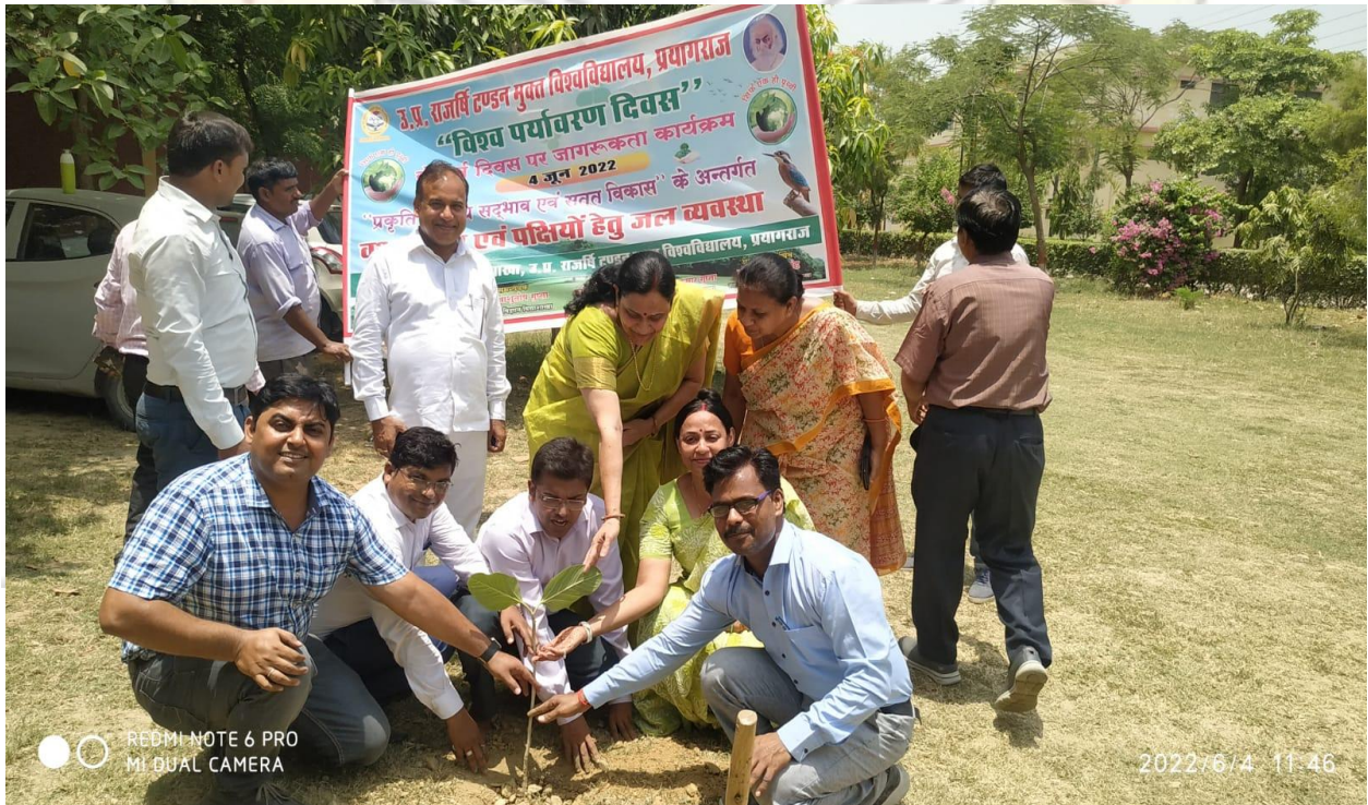
Plantation by faculty of Sciences, UPRTOU