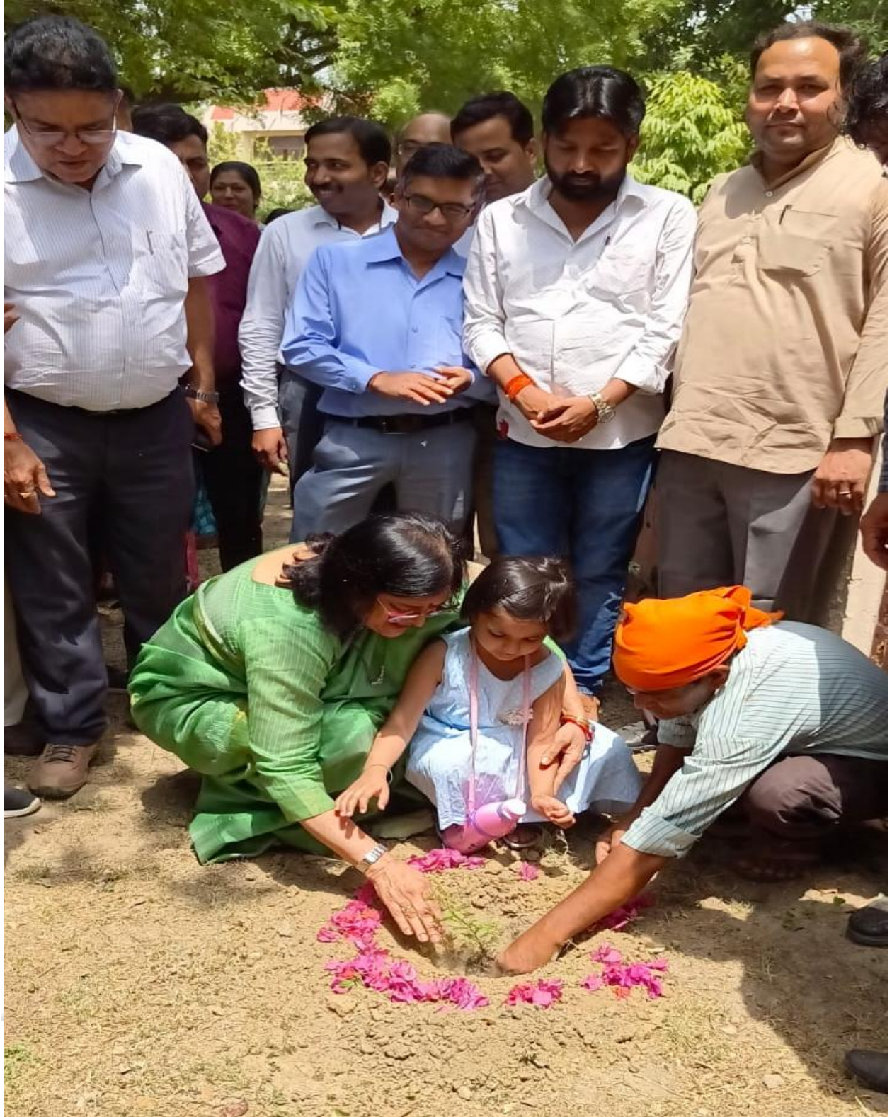
Honorable Vice Chancellor planting a Shami ( Prosopis cineraria ) tree