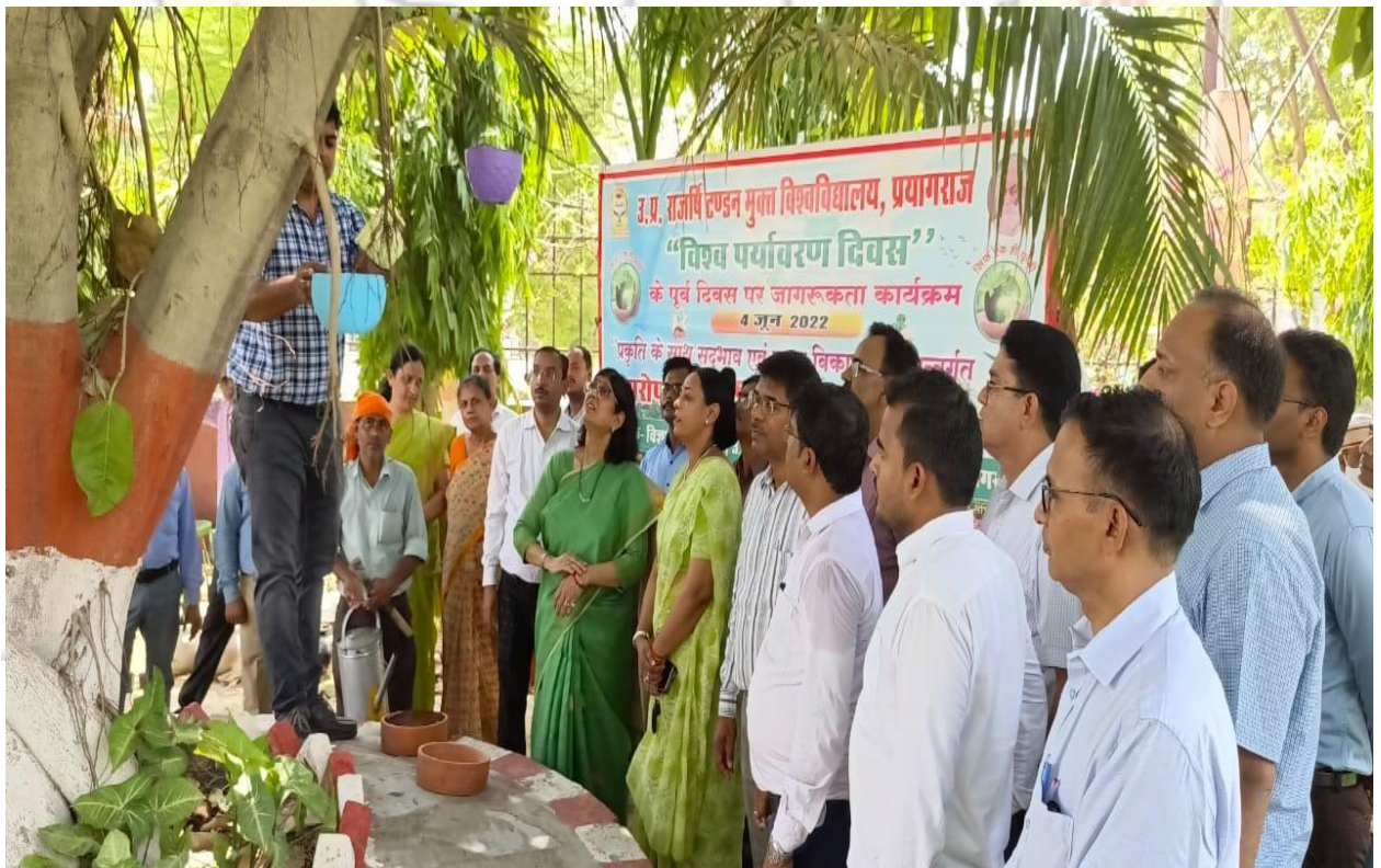
Keeping bird nest by honorable Vice Chancellor