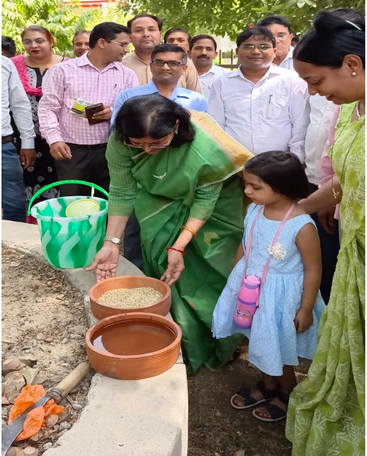
Keeping water for bird by honorable Vice Chancellor