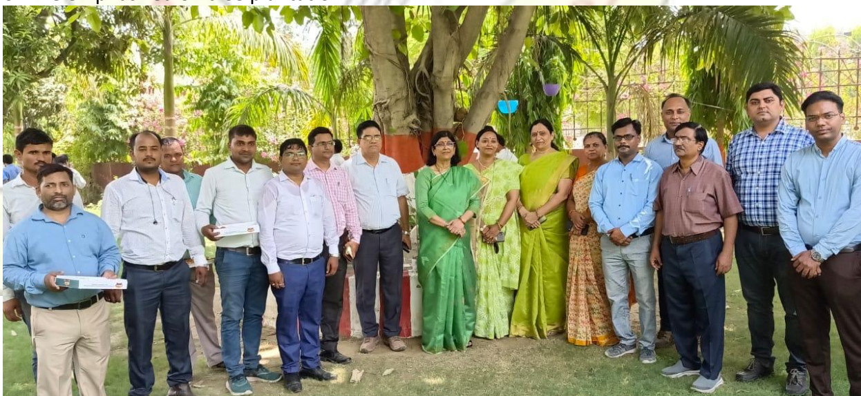
Hon'ble vice Chancello, teachers and employees participated in this environmental awareness program