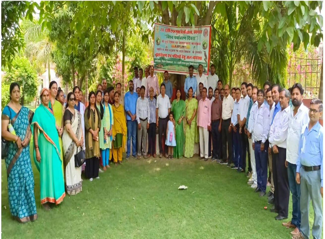
Teaching and non teaching staff participating in awareness program