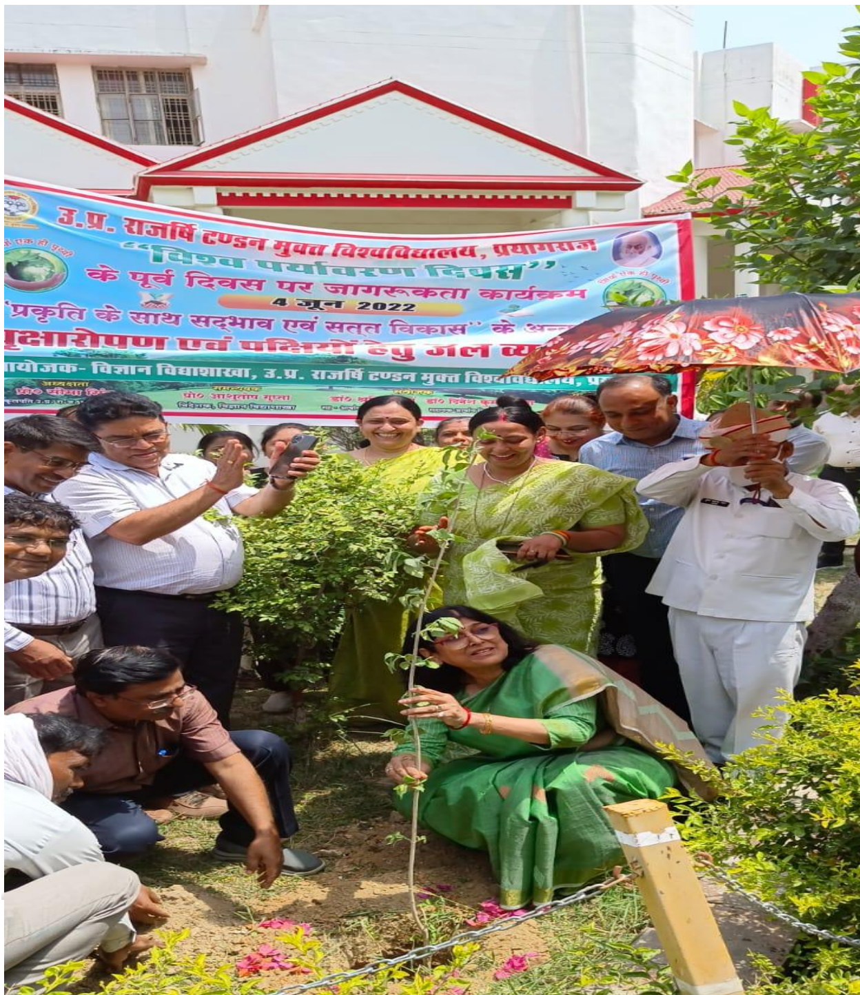
Honorable Vice Chancellor planting a Prarijat ( Nyctanthes arbor-tristis ) tree