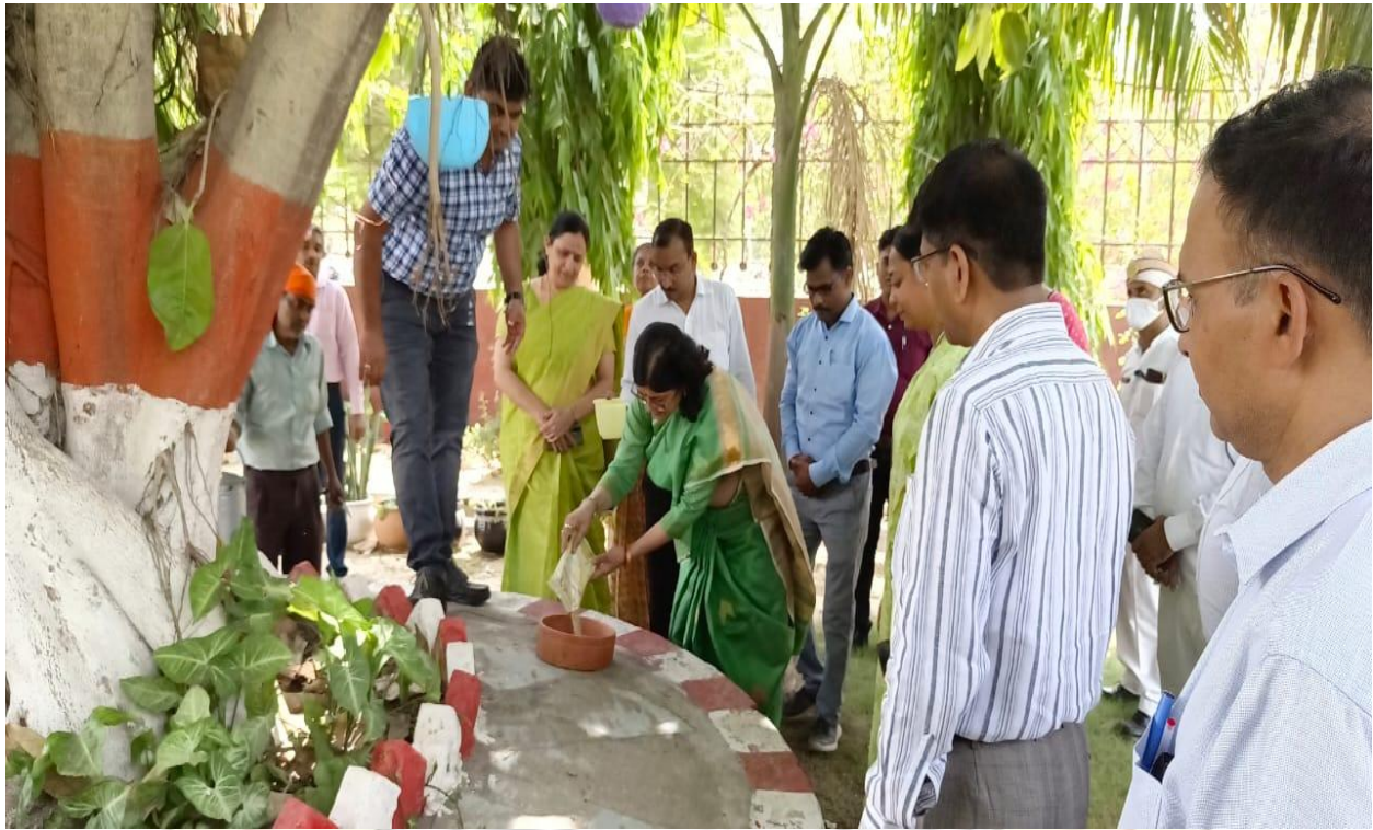
Keeping feed for bird by honorable Vice Chancellor